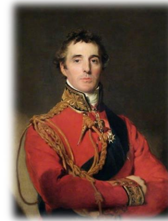
The Duke of Wellington