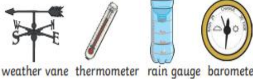
weather vane thermometer rain gauge barometer

Different instruments can be used to measure and record the weather.