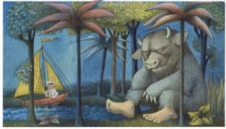
STORY AND PICTURES BY MAURICE SENDAK