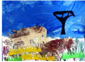
Painting the Savannah in mixed media

Painting the Savannah Children will paint the Savannah using mixed media.